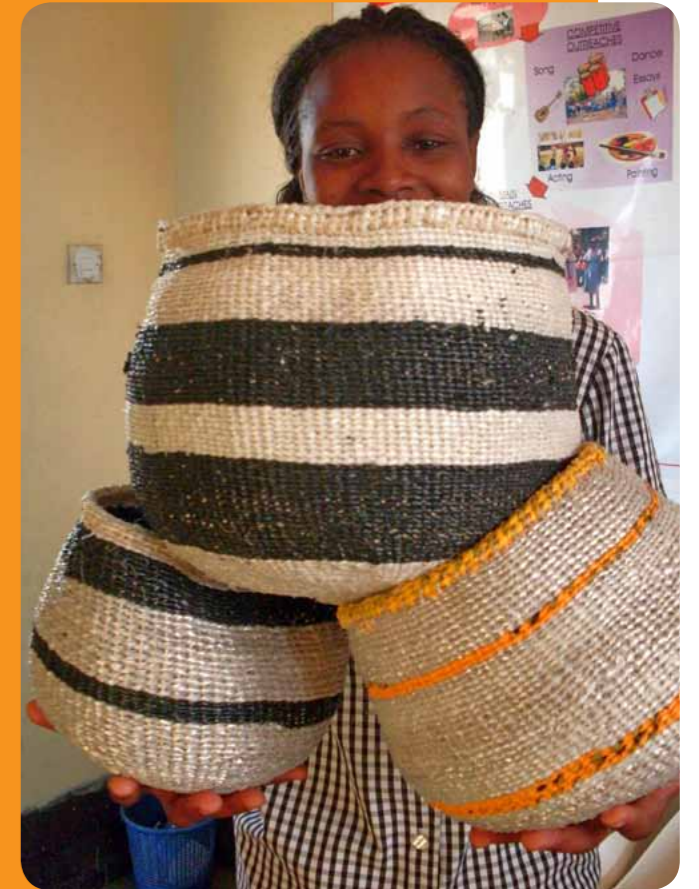
Youth for Life Kenya