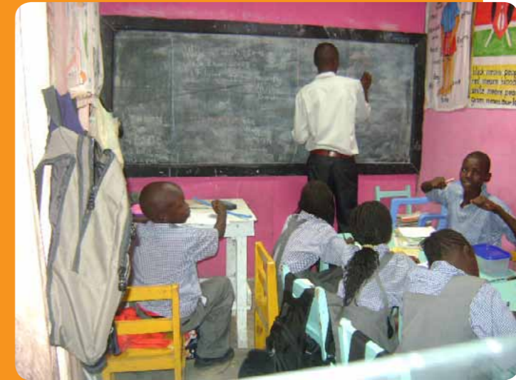
Kilele Junior School