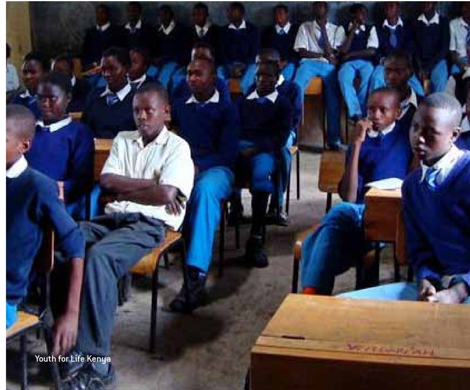
Youth for Life Kenya