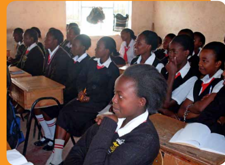
Youth for Life Kenya