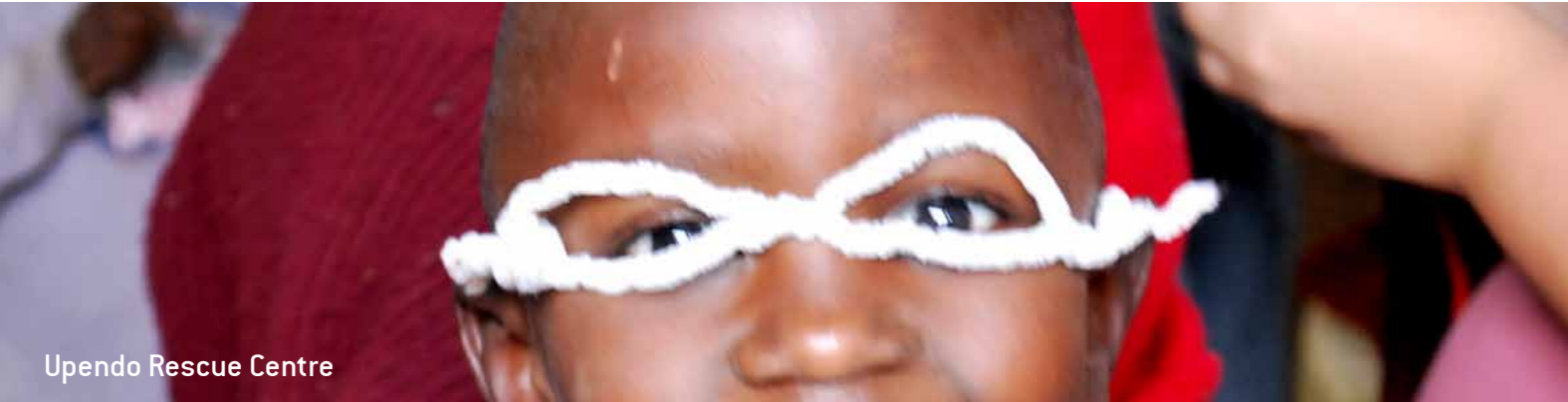
Upendo Rescue Centre

Starting in 2011, Kuleana can count with three organizations, Kilele Junior School, in Komarok, Upendo Rescue Centre, in Mukuru Slum and Youth for Life Kenya, in Athi River. All of them follow a similar line of work and needs, each one with their uniqueness.